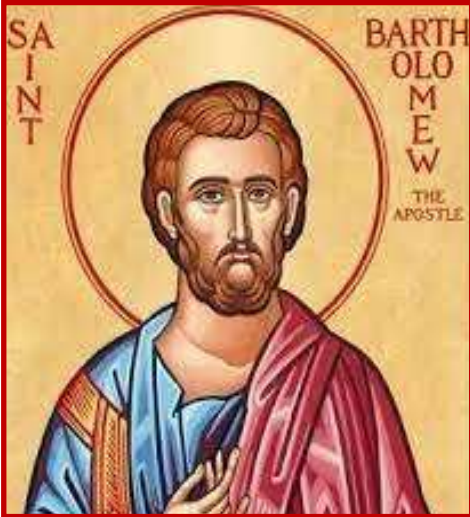
St Bartholomew (Born 1st Century AD: Died 1st Century AD), Feast Day 24 August

Saint Bartholomew lived in the first century AD and was one of the Twelve Apostles of Jesus Christ. He was introduced to Jesus through Saint Philip and is also known as "Nathaniel of Cana in Galilee," notably in John's Gospel. Saint Bartholomew is credited with many miracles related to the weight of objects. He was martyred in Armenia, being either decapitated or skinned alive.