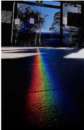
Spread a Rainbow!

We will provide another focus on some more photos for you again next week! Enjoy this week's portfolio!