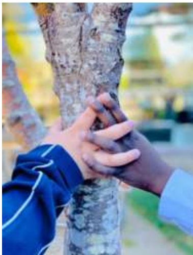
We are a Team!