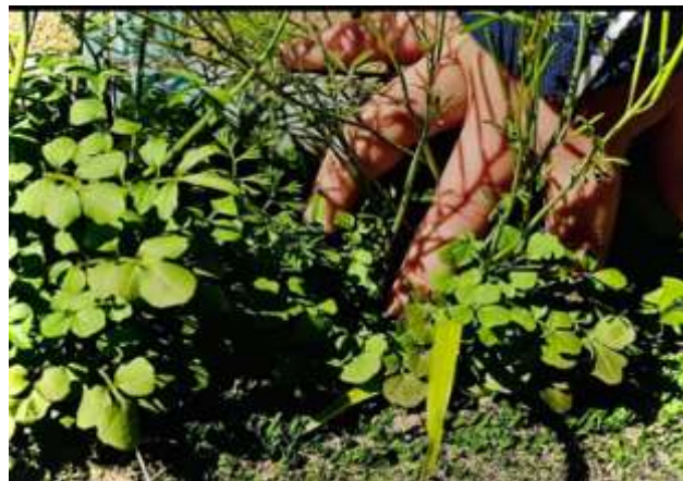
You Must Be Gentle