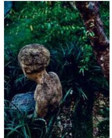
A Moment of Reflection